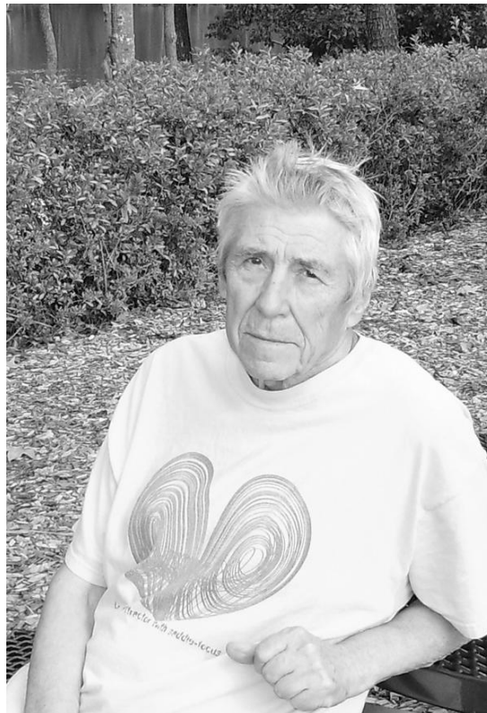
L.P. Shilnikov in 2010

On 26th Dec 2011, the world lost one of the true pioneers of nonlinear dynamical systems theory; Leonid Pavlovich Shilnikov (known simply as LP to his friends). He died of cancer, at home in Nizhny Novgorod surrounded by his family, nine days after passing his 77th birthday.